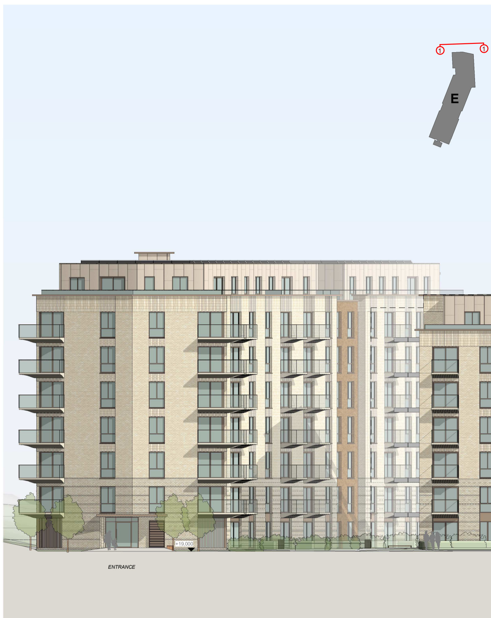
1 North Elevation 1:200