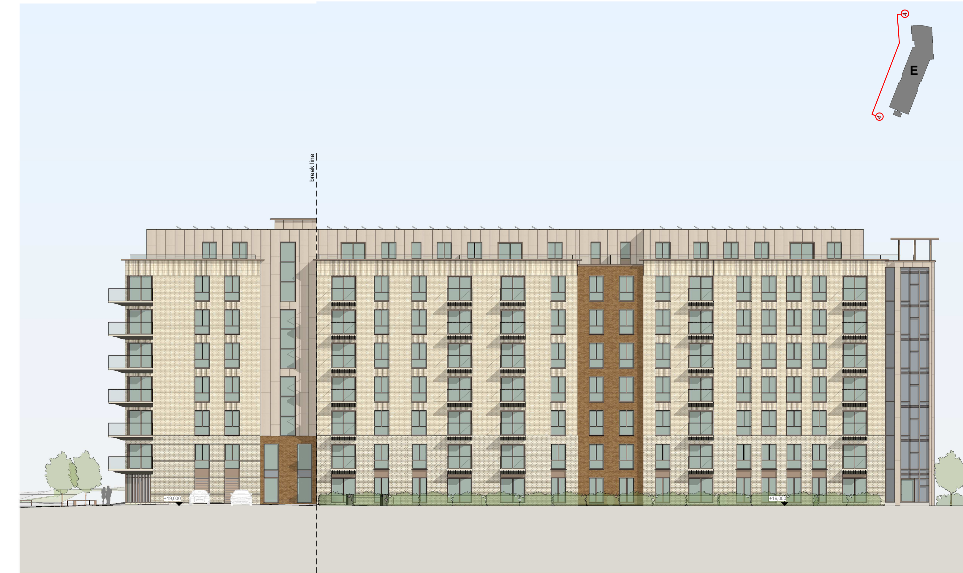
4 West Elevation (Flattened) 1:200