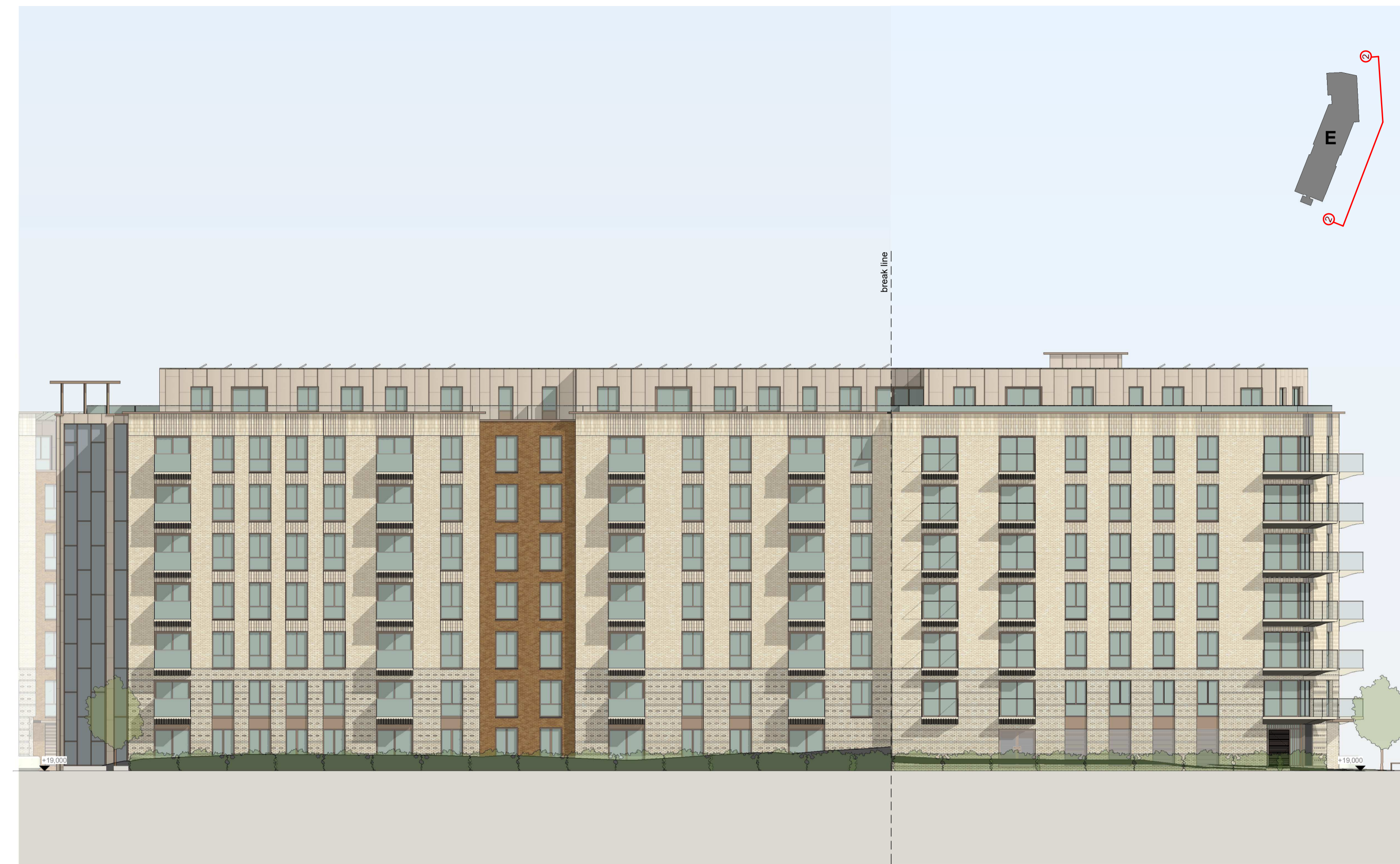
2 East Elevation (Flattened) 1:200